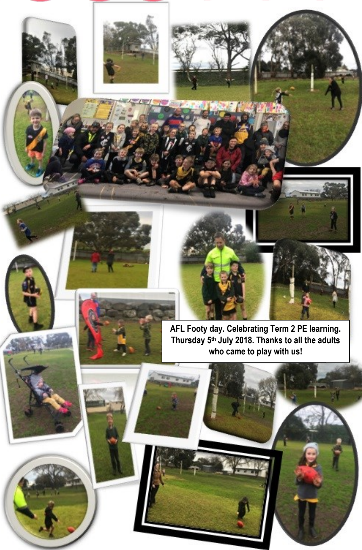
AFL Footy day. Celebrating Term 2 PE learning. Thursday 5 th July 2018. Thanks to all the adults who came to play with us!